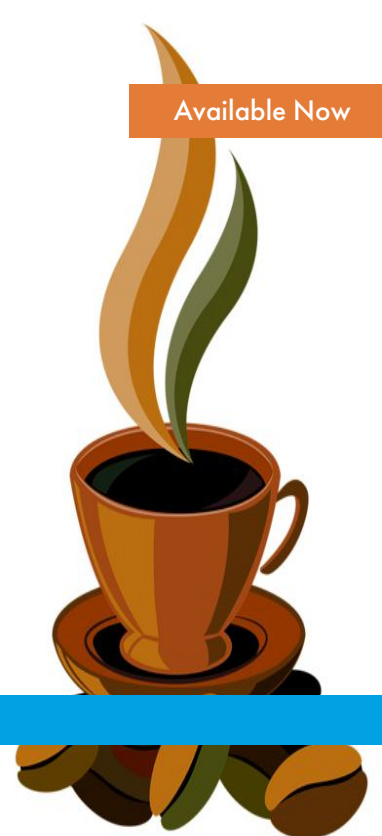
Retail Unit - Market Harborough Station